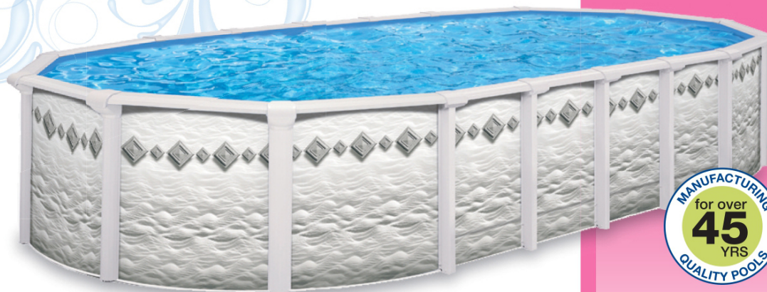
NBS oval Pacific - TileStone wall offered in 52 inches

Let your dream become reality. With the PACIFIC pool it is possible!