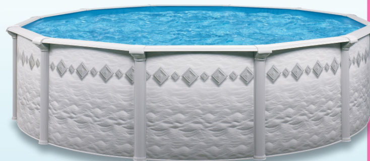
Round Pacific - TileStone wall offered in 52 inches