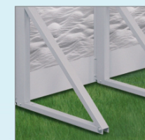
Heavy-duty angle brace system