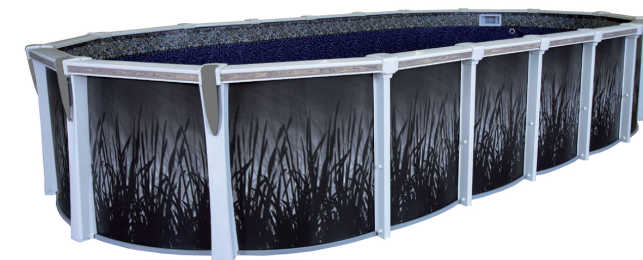
Nature wall shown