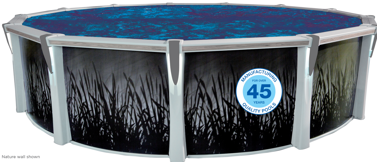
Nature wall shown