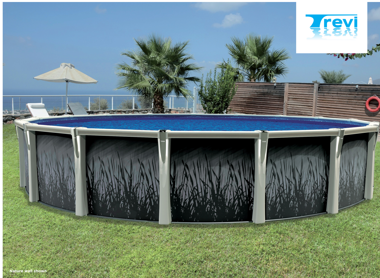
Nature wall shown